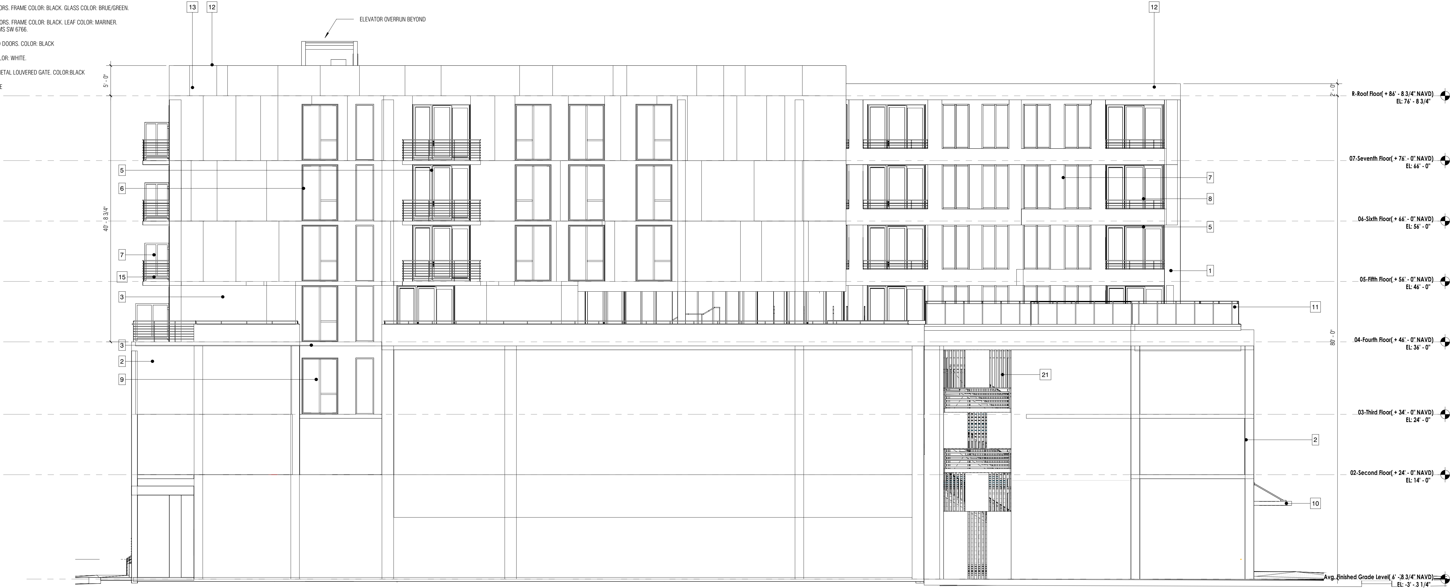
1 02 OVERALL NORTH ELEVATION A - 11 Scale: 1/8" = 1'-0"

GLAZING NOTE: ALL GLAZING TO BE TRANSPARENT AND OF LOW REFLECTIVITY TO ALLOW VIEW OF HUMAN ACTIVITY WITHIN THE BUILDING.